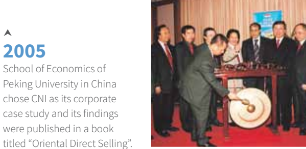
2004, 2005 Won "Super Excellence Award of Direct Sales" award in 2004 and 2005.