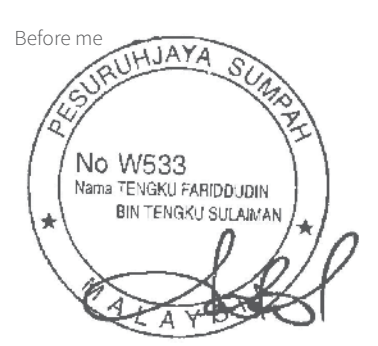
Commissioner for Oaths