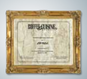
1996, 1997, 1998 Won the "Master of MLM" award for 3 consecutive years.