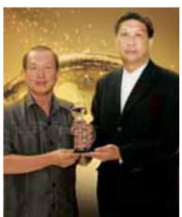
2012 Awarded the Global Code of Ethics for GOLD Category by WFDSA and DSAM.