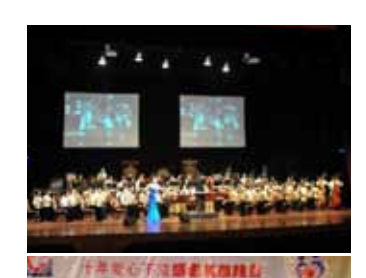
2012 Organised ZheJiang Chinese Orchestra Concert.